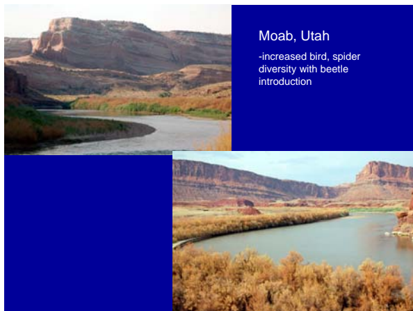
Moab, Utah -increased bird, spider diversity with beetle introduction