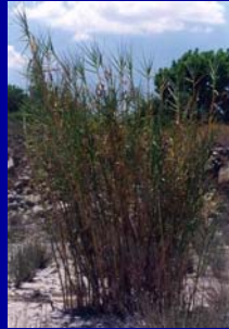
Arundo donax : Giant Reed