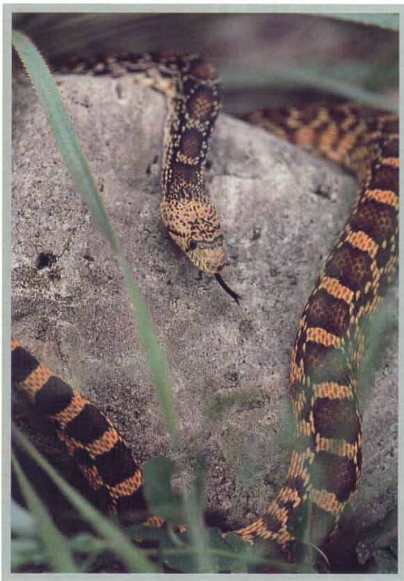
GOPHER SNAKE ( PITUOPHIS MELANOLEUCUS ), GRAY HAWK RANCH

Ranchers are testy about their claim here; it's a tough enough life they've inherited without city-bred environmentalists challenging their rights to graze and irrigate. But now, as the Sunbelt booms, farmers and environmentalists