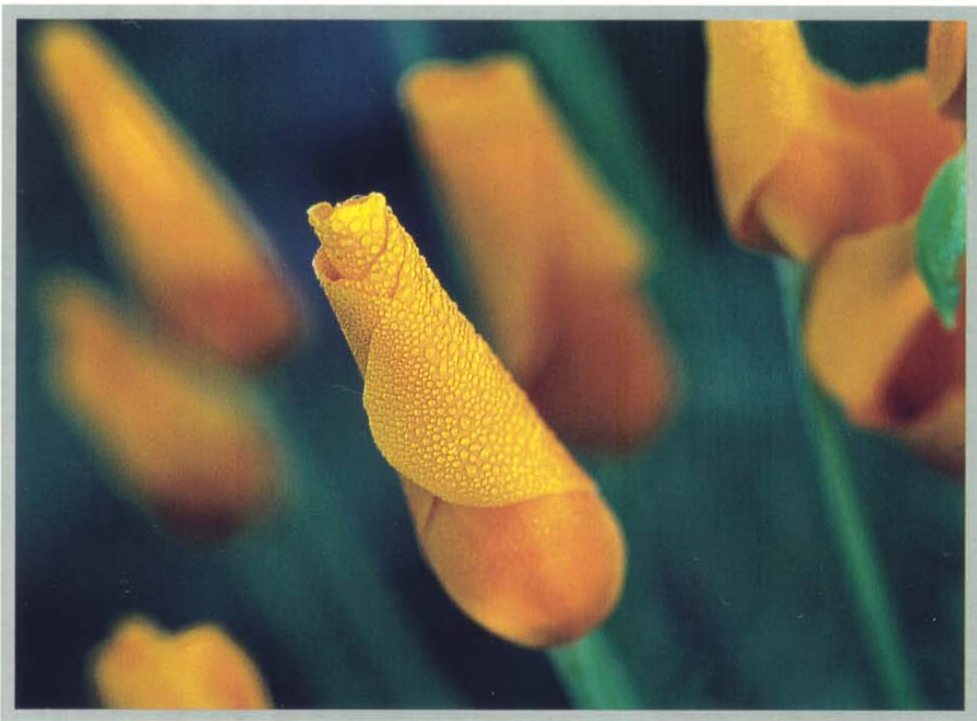
MEXICAN POPPY ( ESCHSCHOLTZIA MEXICANA ), NEAR REDINGTON

call the river valley a “biological treasure chest” because it holds one of the most varied collections of species in the U.S., including a frog that numbers fewer than a hundred adults (lower left) and birds that travel this north-south corridor during spring and fall.