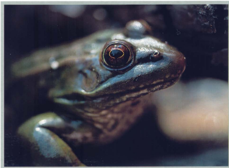
RAMSEY CANYON LEOPARD FROG ( RANA SUBAQUAVOCALIS ), RAMSEY CANYON

DAMS AND CANALS have drained most rivers in the Southwest, leaving the San Pedro a slender refuge in a sere landscape at the crossroads of four ecosystems—the Sonoran and Chihuahuan deserts and the Rocky and Sierra Madre mountains. Conservationists