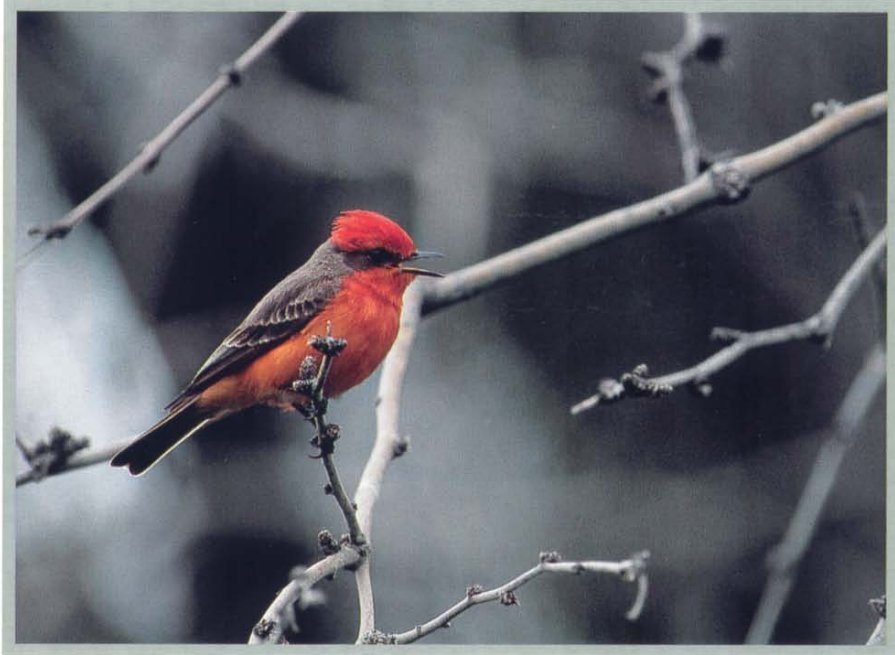
VERMILION FLYCATCHER ( PYROCEPHALUS RUBINUS ), NEAR BENSON