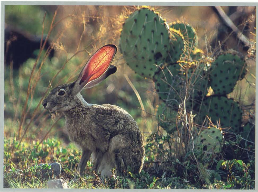
BLACK-TAILED JACKRABBIT ( LEPUS CALIFORNICUS ), NORTH OF BENSON

Rivers like this were once common in the Southwest, with permanent flow supporting long corridors of cottonwood-willow gallery forest that netted the body of the Sonoran Desert like veins. Now, in a land bled dry by agriculture and population growth, only 5 percent of the original forest remains. Riparian species have become concentrated in disparate fragments of creekside habitat. The species list is impressive, but among many orders of animals and plants it’s not as long as the roll call of those that have perished quietly. (Of the 13 species of fish originally native to the San Pedro, for instance, 11 are gone.) Beavers used to dam the rivers into strings of marshy pools, keeping the water table high, but they were hunted out long ago. It’s no surprise to a desert hiker, anymore, to top a hill and look down on a ghost parade of giant, leafless cottonwoods snaking through the valley below, dying in place, marking a watercourse that has gone and won’t be back.