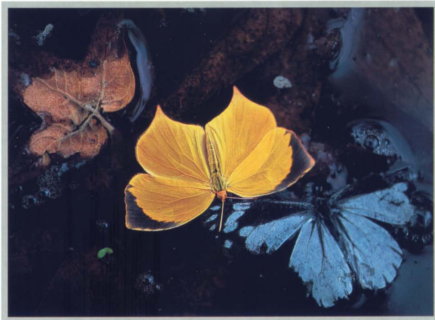
BUTTERFLIES ( EUREMIA PROTERPIA , LEFT; NEOPHASIA TERLOOTII , RIGHT), RAMSEY CANYON PRESERVE