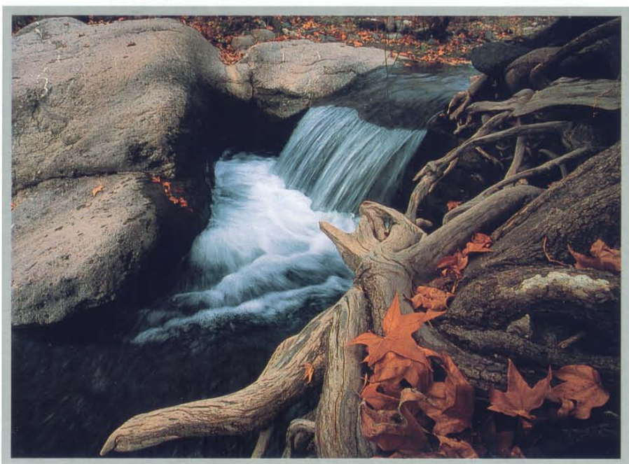
HOT SPRINGS CREEK, MULESHOE RANCH COOPERATIVE MANAGEMENT AREA